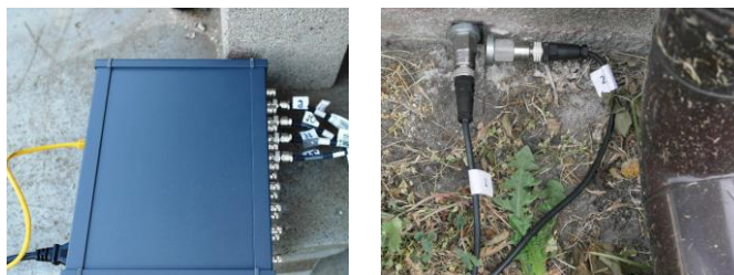
Fig. 2. Specialized measuring equipment and piezoelectric accelerometers mounted on the wall of the tested building.

The measurements were made using specialist equipment (see Fig. 2). Piezoelectric acceleration sensors were connected to the measuring apparatus in their assigned sockets, which were previously configured (accordingly). During the tests 6 sensors were used mounted on the foundation wall of a building parallel to the street, just above ground level according to [6]. After connecting the sensors and setting the apparatus, calibration was carried out. On the computer connected to the measuring apparatus, the time histories shall be performed during passing of various types of vehicles (two-axle buses, vans and trucks with a total weight up to 10 t and for buses and trucks weighing over 10 t and have more than 2 axles.