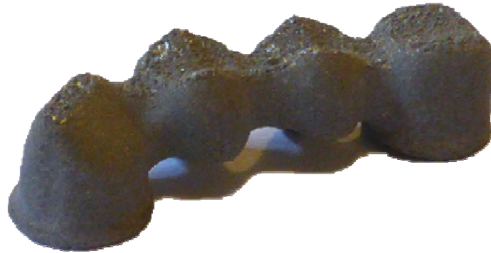
Fig. 2. The prosthetic bridge obtained by selective laser melting method (SLM) before sandblasting