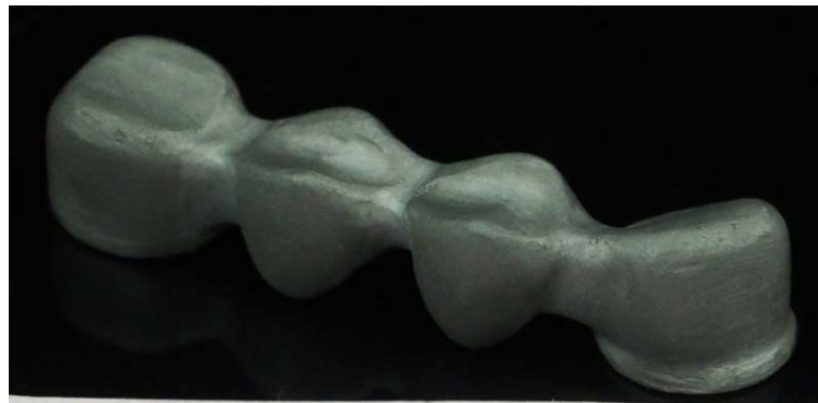
Fig. 3. The prosthetic bridge obtained by selective laser melting method (SLM) after sandblasting