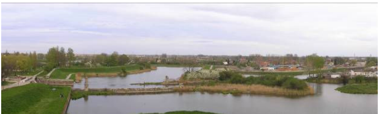
Fig. 4 Polder area within the city – Olszynka district, on the left The Stone Lock – the water gate to the city

Emphasizing the role of water, and integrating the public space system with it, is a starting point for the processes of re-defining the city and changing it into well-connected environment. Apart from other advantages, it