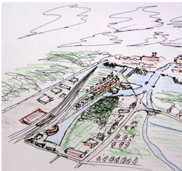
Fig. 5 Gdańsk. A connection strategy for the polder area, fortifications and the centre of the city. The concept developed in frames of the Erasmus IP Bridging the City – Water in Architecture, Urban Spaces and Planning, Gdańsk 2007

There are many such sites that gain deeper understanding in the perspective of the landscape-water relationship. For many years the connectivity between them was hindered by industry, but today their isolation can be broken. One of the results of the Polish-Dutch workshops Water in the City which took place in 2006 in Gdańsk was to show how much the spatial and landscape integration of the city is dependent on integration of existing water systems. To link them, apart from connecting of the city, would re-introduce these very special areas. This includes, for example, the city district of