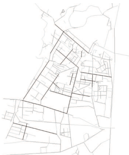
Figure 4: (Right) The extracted open spaces that seem to be the most significant ones for the development of the community in Gdansk Osowa (illustration: Weronika Dettlaff).

Slika 4: (Desno) Izbrani so prostori, ki so najbolj pomembni za razvoj skupnosti gdaškega mestnega območja Osowe. (ilustracija: Weronika Dettlaff).