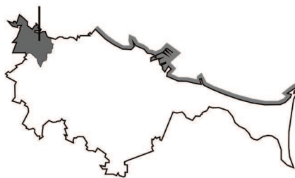
Slika 1: a) Shematska karta Poljske; b) Shema mesta Gdańsk (ilustraciji: Weronika Dettlaff). Figure 1: a) Schematic map of Poland; b) Schematic map of Gdańsk (illustrations: Weronika Dettlaff).