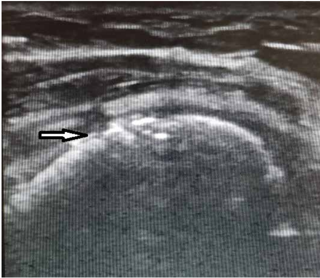
Figure 1: Irregular shape of humeral head (black arrow).