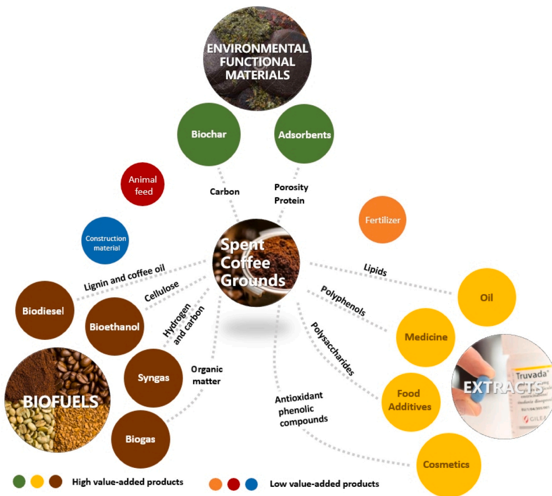
Fig. 2. Various value-added products and the components used.

of relevant literatures, the degree of technological maturity and the prospect of industrial and commercial applications.