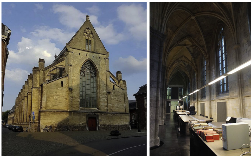
Figure 2 Former Minorite Church: a view from the outside and the inside (photo by J. Szczepański).