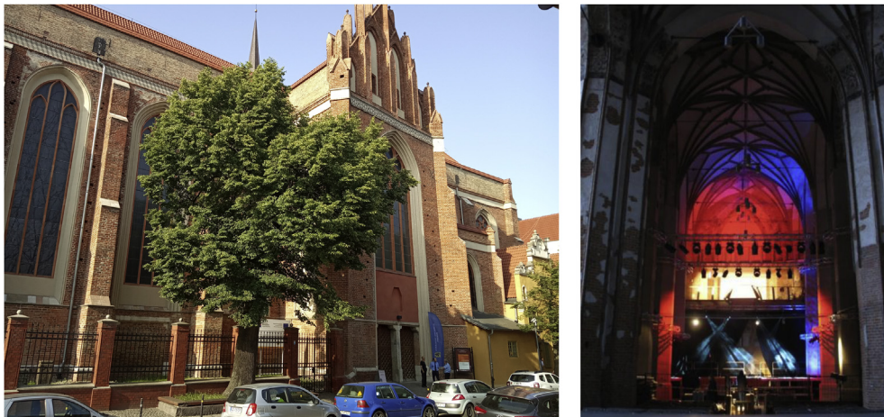
Figure 5 St. John's Church: view of the exterior and main entrance and the interior of the Church during a cultural event.

This church was in ruins in the 1980s, and only the former sacristy and library were used as offices for the restoration workshops. Despite the catastrophic condition of the building, Archbishop S. Gołowski applied to governmental authorities to have it transferred to the diocese of Gdańsk.