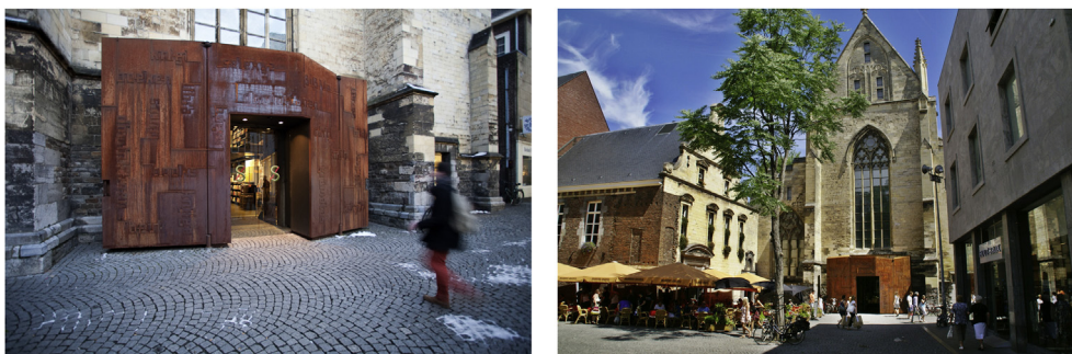
Fig. 8 Former Dominican Church: the newly designed entrance and a view of the outside café area.