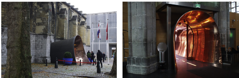
Figure 3 Former Church of the Kruisheren Monastery: a new entrance to the Kruisherenhotel – a view from the outside and inside (photo by J. Szczepański).

a newly designed distinctive entrance (Fig. 3) (Kuśnierz-Krupa and Krupa, 2008).