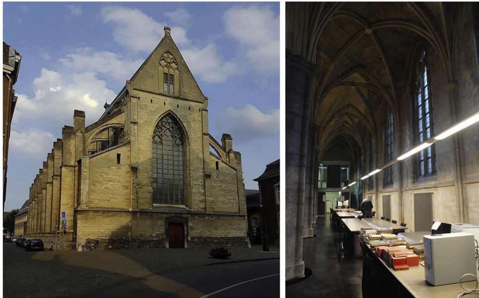
Figure 2 Former Minorite Church: a view from the outside and the inside.