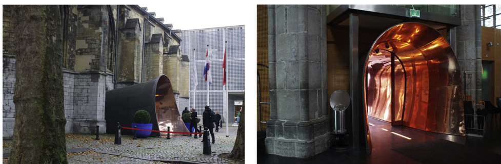
Figure 3 Former Church of the Kruisheren Monastery: a new entrance to the Kruisherenhotel – a view from the outside and inside.

a newly designed distinctive entrance (Fig. 3) (Kušnierz-Krupa and Krupa, 2008).