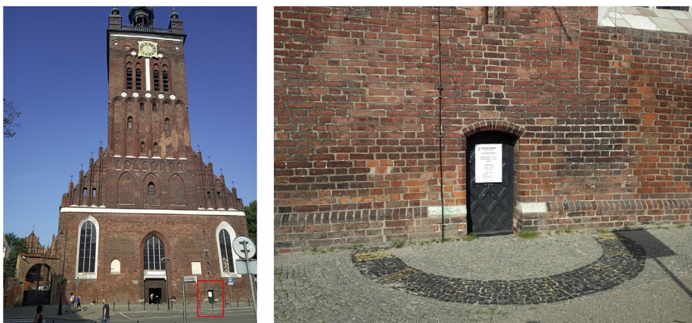
Figure 6 St. Catherine’s Church: on the left a view of the main entrance and entrance to the museum (which is marked by a red rectangle); on the right, a close view of the entrance to the museum and viewpoint.