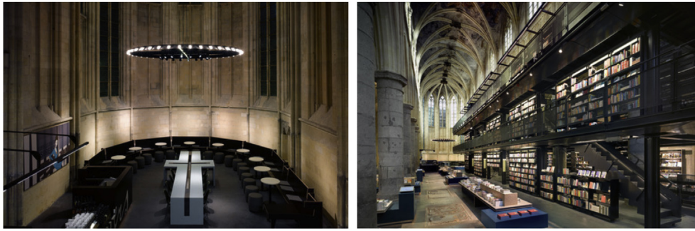
Figure 4 Former Dominicanen Church: interior of the Selexyz Dominicanen Bookstore (“Merx + Girod,”).