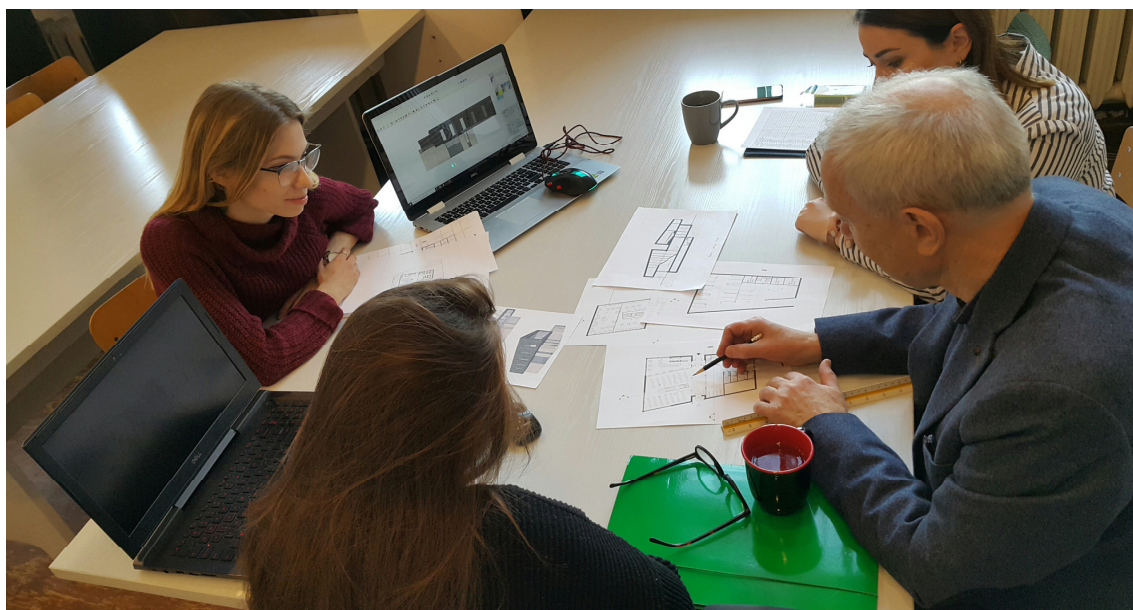
Fig. 3. The designing class at the Architecture Faculty of Technical Gdansk University supervised by the professor of architecture supported by the civil engineer tutor.

Optimization of the academic teacher profession while striving to improve the level of specialization in architectural education affects the qualification requirements of persons providing education at European architecture schools in Master's degree education courses. There is a tendency to divide classes into groups in which classes can be conducted only by carefully selected supervisors - 'masters' alike. Education aimed to achieve high-level education effects in groups focused on design is expected to be conducted by tutors with significant contributions to the development of the scientific discipline - architecture and urban planning, building qualifications in the architectural specialty and professional experience acquired in design practice. Supervising in the designing classes group may also be conducted in cooperation with other tutors having professional experience adequate to the scope of the activities. Alike in the case of persons entitled to supervise masters diplomas in architectural education, a project elaborated through a master-apprentice formula, supervisors are expected to have - in addition to significant scientific achievements constituting an essential contribution to the development of a given scientific discipline - building qualifications in the architectural specialty and professional experience acquired in design and construction activities as well as significant project achievements.