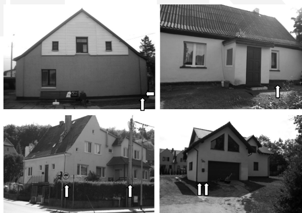
Fig. 1. Buildings tested for traffic-induced vibrations (arrows indicate the locations of vibration sensors)

In this study, the vibration field measurements taken on four residential buildings are presented (Fig. 1). The source of vibrations was related to the movements of vehicles with varying tonnages and number of axles, travelling at different speeds. For each building, a series of several tests was conducted. As the outcome of the tests, after the analysis in 1/3 octave bands, authors received about 400 results for each building. The peak values were selected and plotted on Dynamic Influence Scale I graph (DIS I). Fig. 2 and Fig. 3 show examples of graphs of peak accelerations with respect to the centre frequencies. After performing an analysis consistent