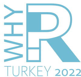
Figure 1: The logo of Why R? Turkey 2022 Conference

Participation certificates for attendees, speakers, workshop tutors and panelists were prepared