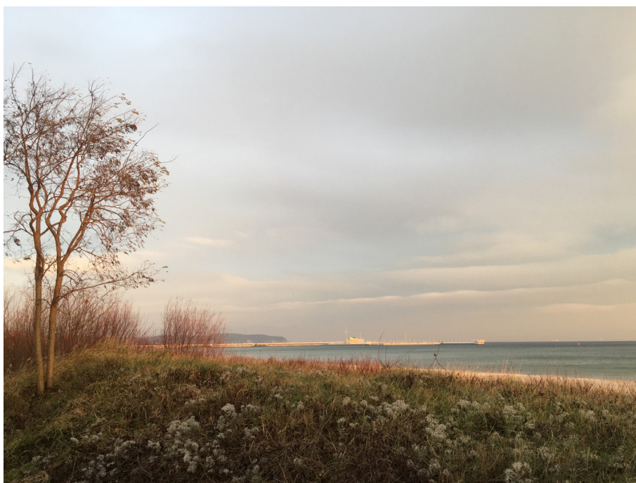
Figure 1. The Bay of Gdańsk at Sopot, Poland with a view of the Sopot Pier and the Orłowo Cliff

Assuming that maritime space is part of the wider geographical space in its real terms but also in its formal and perceptive dimension, it is important to identify the relationship that constitutes maritime space as a subspace of geographical space. The main problem is the different geographical extent of those relations. They are of socio-economic (economic), natural (including