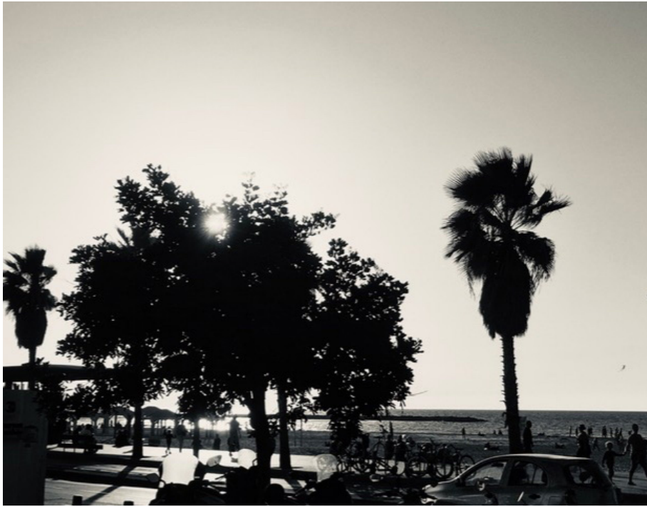
Figure 3. Tel Aviv waterfront