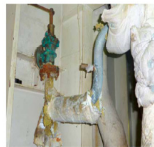
Temporary wooden plug in steam line [2]