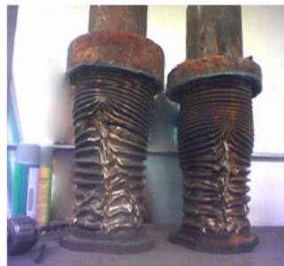
Expansion joints on a steam line that have been destroyed by water hammer [7]