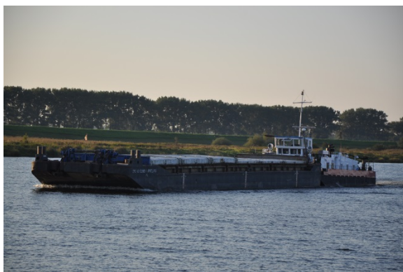
Fig. 1. Inland waterway transport by the Vistula River.

The lack of a direct inland connection between the Port of Gdynia and the Vistula delta is connected with significant difficulties in transporting cargo by inland navigation. In order to load goods, the inland waterway has to enter the Gulf of Gdansk, then to return to Gdynia port. Transshipment and shipping operations in the Gulf of Gdańsk are subject to restrictions due to hydro-meteorological conditions. This is due to the fact that inland vessels are not adapted to navigation and handling at high waves and strong winds. The above factors mean that for the transport of goods inland from the port of Gdynia, it is necessary to equip the unit with additional navigational and emergency devices and to train the crew in the same way as for a sea-going ship.