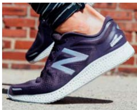
Fig. 2. Midsole printed by New Balance (3D SLS technology)

[ https://www.newbalance.com/article?id=4041 ]