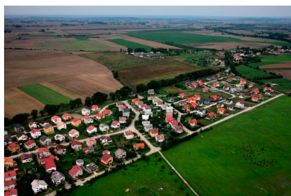
Figure 1. “Field-type” urbanization of rural areas, Szpegawa, Pomeranian voivodeship, from the Pomeranian Agricultural Advisory Centre (Pomorski Ośrodek Doradztwa Rolniczego) collection.

New residential areas usually take the form of a roadside or a so-called field-type development (Figure 1), whose layout is managed by the existing ownership division of agricultural land that is reclassified for building areas, excluding previous merger and subsequent parceling. Small, one-family plots of land, which are usually marked on flat plains in the arrangement of “chocolate bars”, are developed in different periods of time or remain empty, which gives the effect of a visual dispersion. It is aggravated by the absence of ordering elements in the form of dominants, and the lack of tall trees (excluded due to small plot areas) and shrubs as a binding background. As a result, a typical feature of the composition of the contemporary view is “noisy” disorder and an extreme dissimilarity of forms or, on the contrary, their excessive uniformity in the absence of a hierarchy of motives. Landscapes of transformed rural settlements have an amorphous character (Figure 2a). The forms of the traditional agricultural village, on the contrary, were spatially organized: the village had a clear boundary; buildings with low intensity focused on the street or square, and there was greenery on the border of the house; it was surrounded by agricultural lands, which constituted a vast foreground for the view exhibition (Figure 2b). The preserved rural image determines the cultural identity, legal protection, or tourist attractiveness of the places today [42,43].