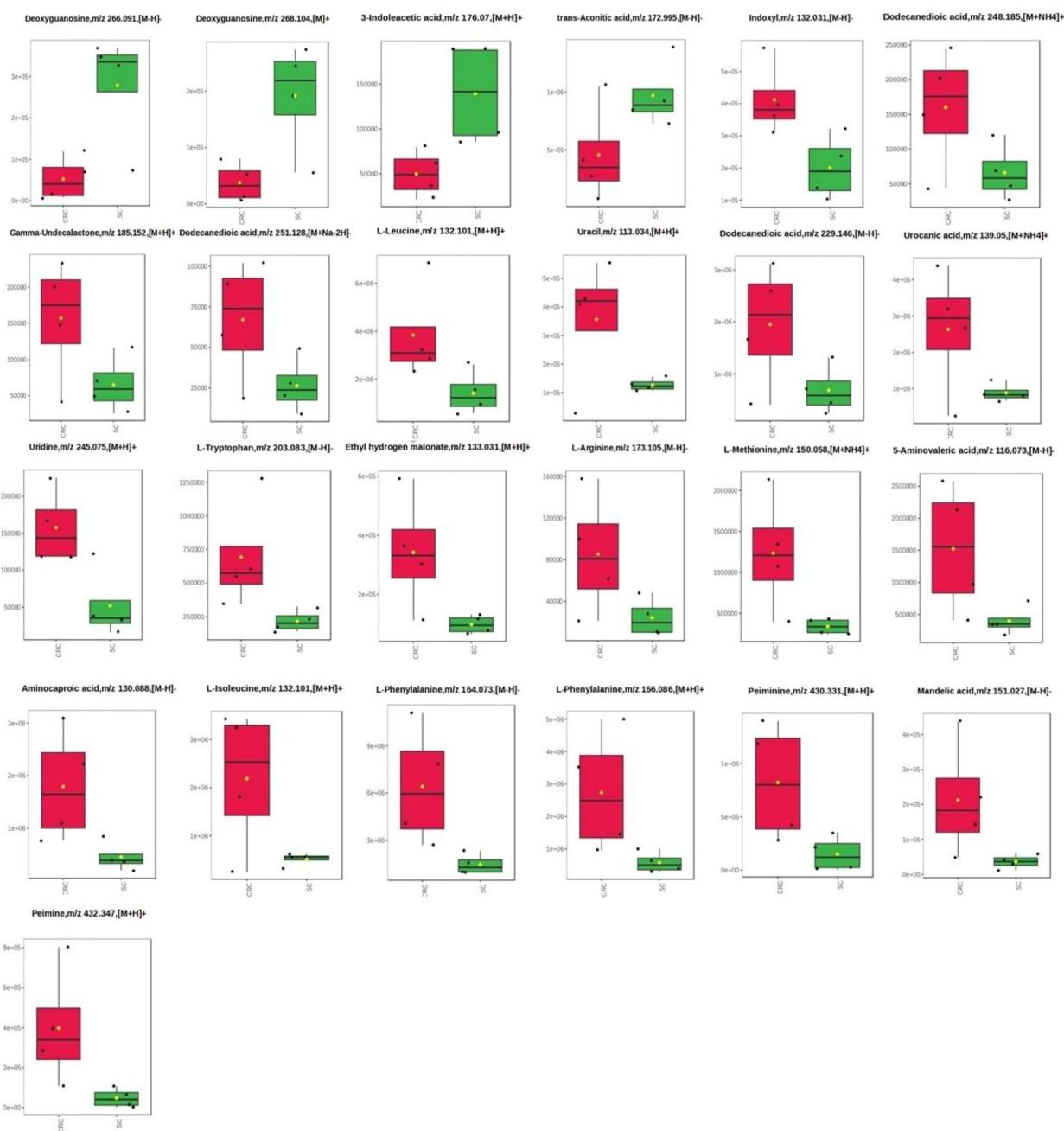
FIGURE 3 The levels of metabolites among SC and CRC.

University of Gdansk, Gdansk, Poland) in which we analyse the impact of anti-cancer treatment regarding chemotherapy and radiotherapy on untargeted metabolomics aspects. This project is currently ongoing in cooperation with multi-disciplinary team of both oncologists and oncological surgeons. It is also recommended to investigate untargeted metabolomics among patients with similar both stage and grade of the cancers, nevertheless it might be challenging to collect stool samples with larger sample size. However, it would provide promising strategy to be included in clinical aspects. Metabolomics-based biomarkers might provide earlier detection of cancers allowing to complete resection of tumour. Moreover, metabolomics-related