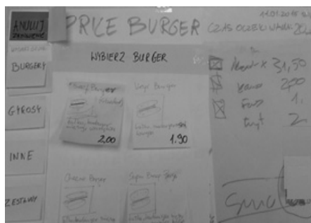
Fig. 1. A low-fidelity prototype of an touch-screen kiosk

Examples of low-fidelity and interactive user interface prototypes for a fast-food ordering by a touch-screen device are shown in Fig. 1 and Fig. 2, respectively.