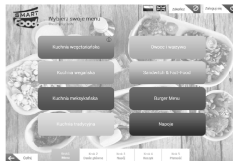
Fig. 2. An interactive prototype of an touch-screen kiosk