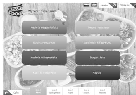
Fig. 2. An interactive prototype of an touch-screen kiosk