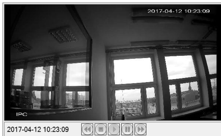
Fig. 3. A view of VideoUserControl during the visualization of video recording [own work]