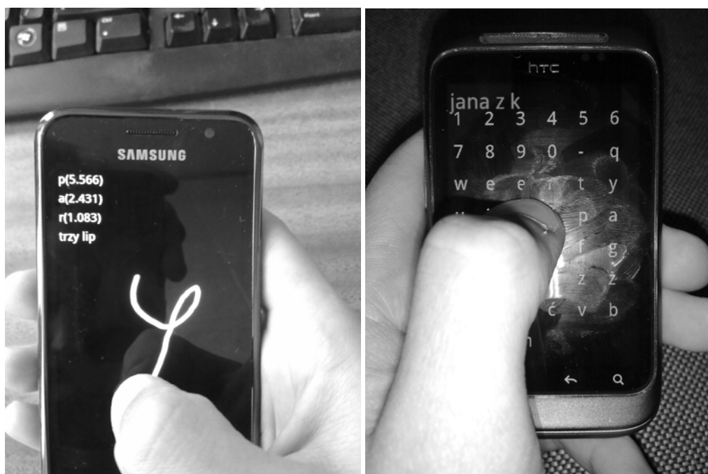
Fig.6. Sample text input method: based on gesture recognition (on the left) and letter choosing (on the right).