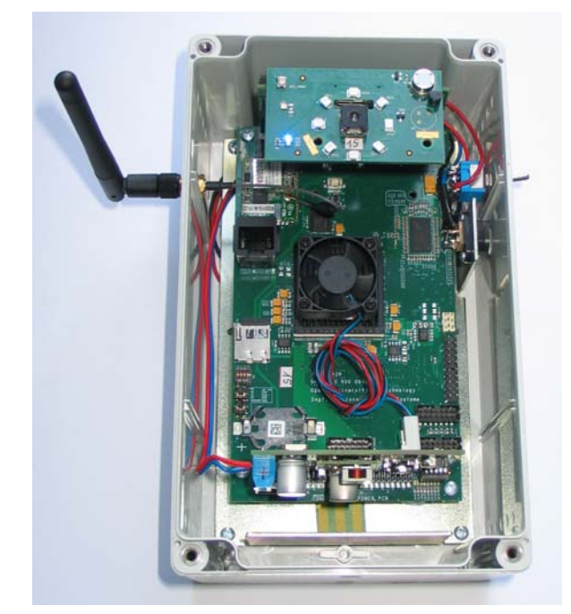
Fig.1. Photo of the prototyping system

controlled by the microcontroller which is also used for power control and measurement of power voltages and currents. The configuration bitstream can be encrypted – a battery socket for the FPGA decryption key memory is supported. An additional reset IC controls reset signal assertion after power on and when the reset push button is pressed. There is also a LED for the configuration process status signalling. A 100 MHz oscillator with differential output is connected to the FPGA to serve as a local clock source.