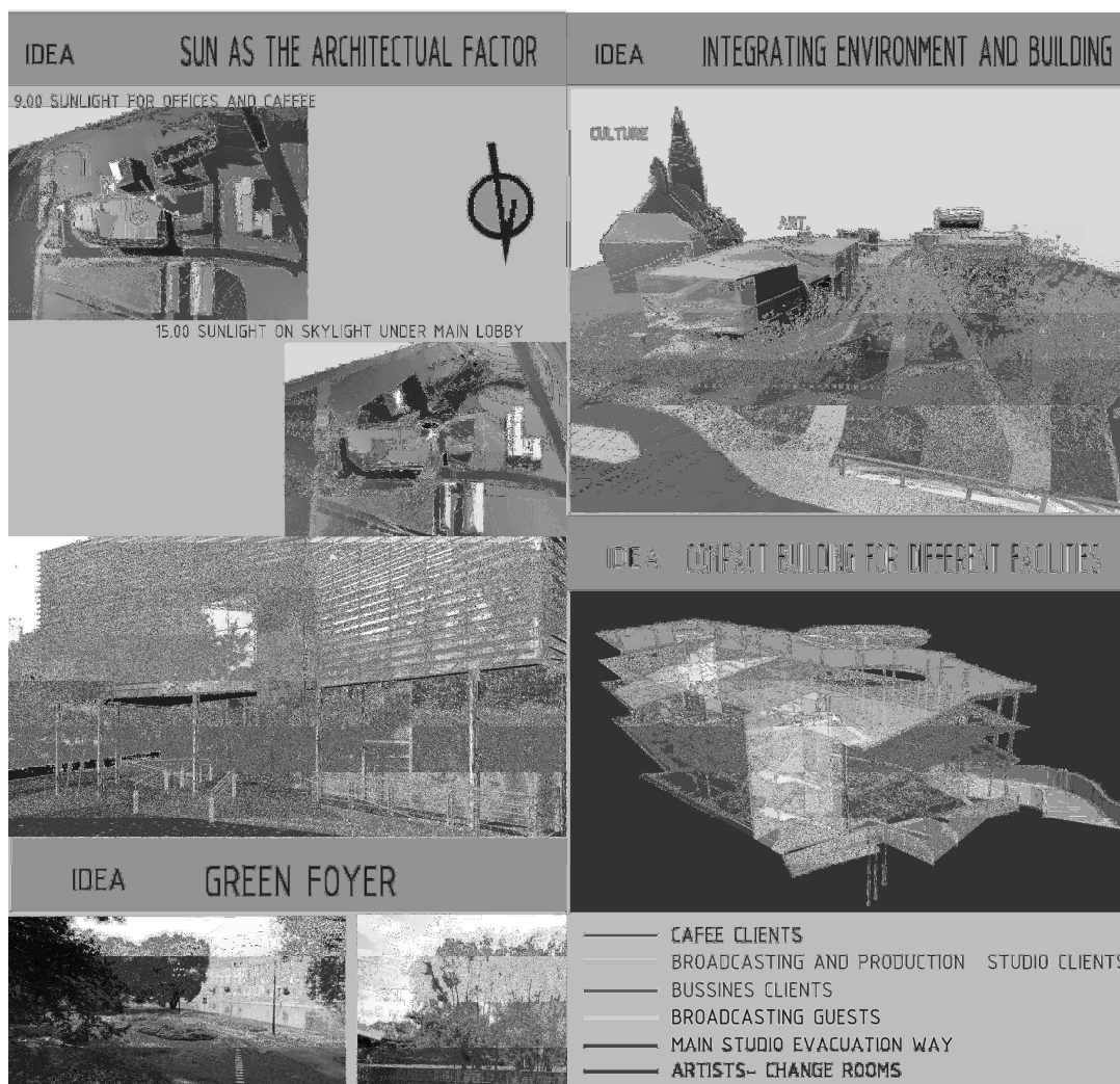
Fig. 3 Analysis of possible infill development urban scenario